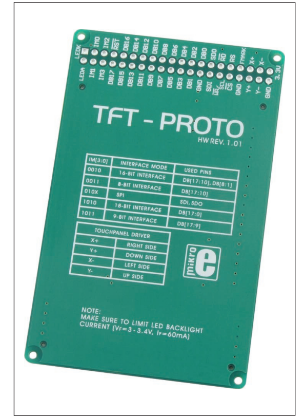
Figure 3: Back side of the TFT PROTO additional board