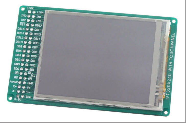
Figure 1: TFT PROTO additional board