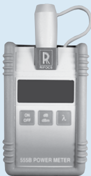
Optical Power Meter Battery-Operated