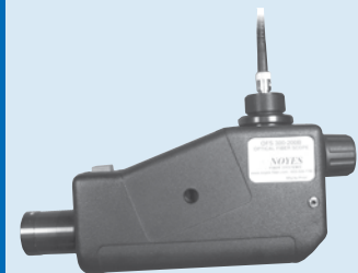
200X Microscope Battery-Operated