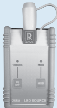
LED Source Battery-Operated