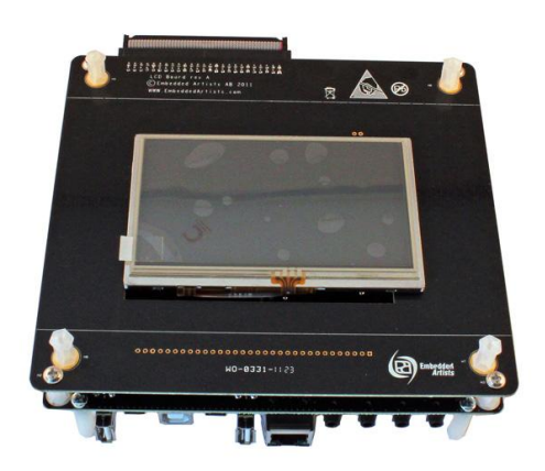
Figure 1 - LCD Board Mounting Options