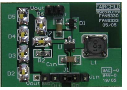
Figure 1: FAN5330/33 SX