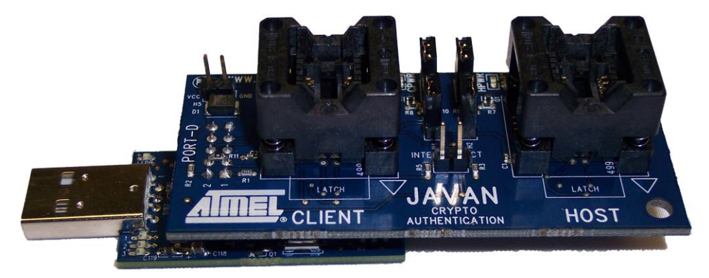
Figure 1-2. The AT88CK109BK8 adaptor board with the Atmel AT88Microbase

The AT88CK109BK8 is sold with the AT88Microbase to form the AT88CK109STK8 starter kit. For additional information on the AT88Microbase, see Atmel doc8723A, AT88Microbase Hardware User Guide.