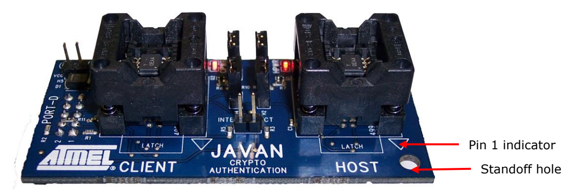
Figure 1-1. Atmel AT88CK109BK8 daughterboard

Atmel<sup>®</sup> AT88CK101BK8 is a daughterboard that interfaces with a mcu board via a 10-pin header. The daughterboard has two 8-pin SOIC sockets which can support HOST and CLIENT development with an Atmel ATSHA204 device. This kit uses a modular approach, enabling the daughterboard to connect directly to an STK series AVR development platform to easily add security to applications. An optional adapter kit is also available when the 10-pin header on the daughterboard requires a different pinout. The AT88CK109BK8 is sold with the Atmel AT88Microbase to form the Atmel AT88CK109STK8 starter kit. The AT88Microbase AVR base board comes with a USB interface that lets designers learn and experiment on their PCs.