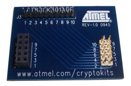
Figure 2-2. Atmel AT88CK301ADP adapter kit

An optional adapter kit is also available when the 10-pin header on the daughterboard requires a different pinout.