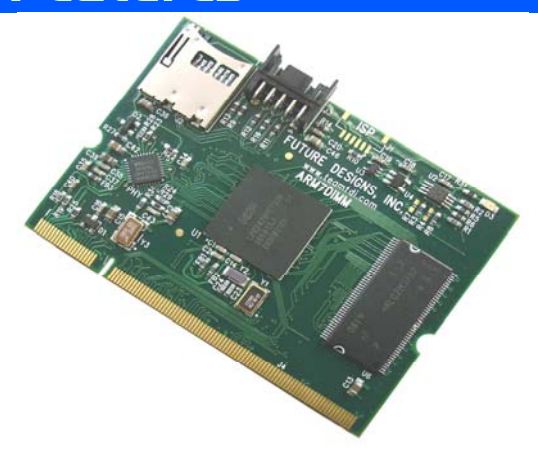
Actual PCB dimensions are 2.66" x 1.89"