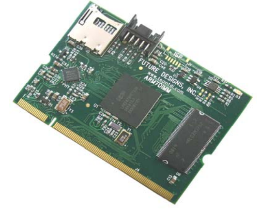
Actual PCB dimensions are 2.66" x 1.89"