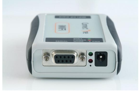
Side view: serial connector, power jack, mode select, SerialNET and power LEDs